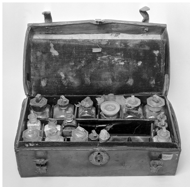
L00007376, David Livingstone's medicine chest, Wellcome Library.

Livingstone Online is a new venture based at the Wellcome Trust Centre for the History of Medicine at University College London.