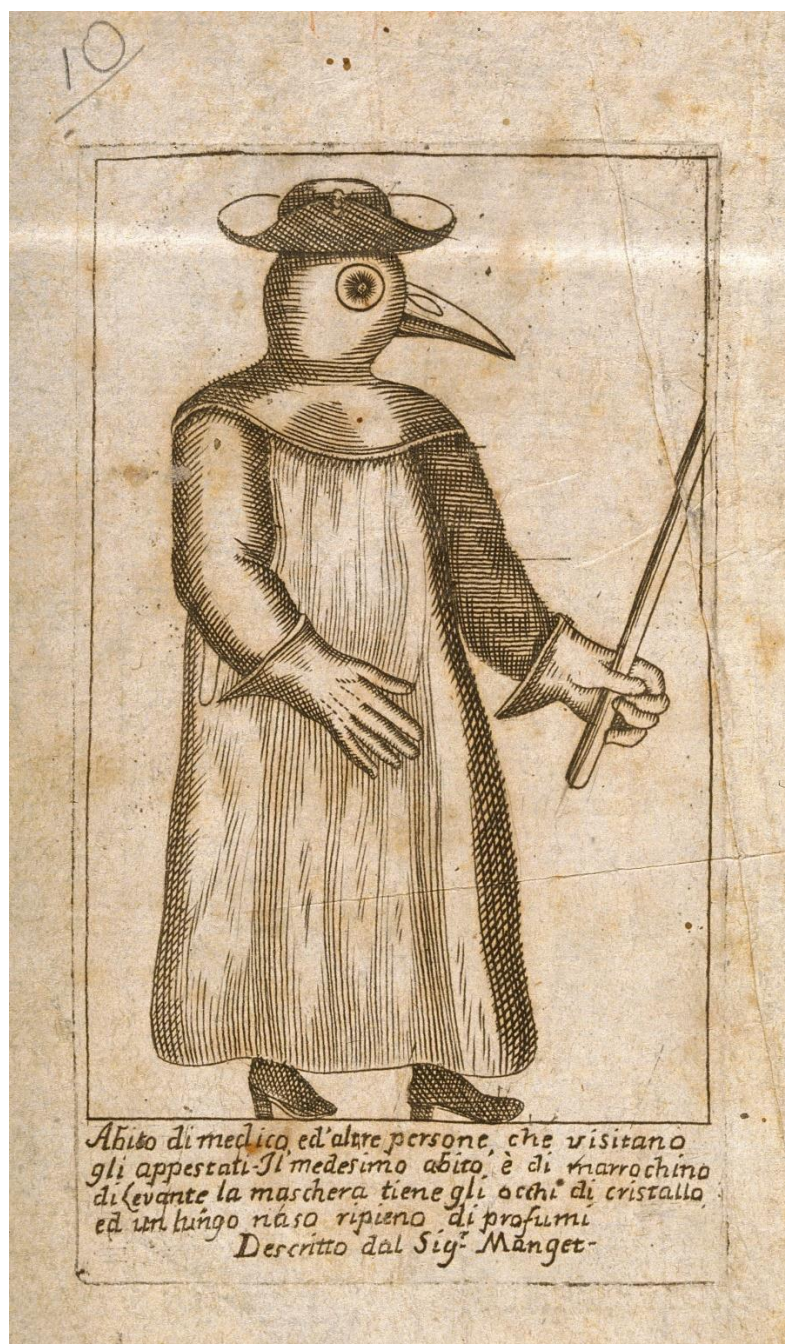
Frontispiece to Maurice de Toulon, 'Traité de la peste', Geneva 1721, vol I.

groups/societyforthe socialhistoryofmedicine